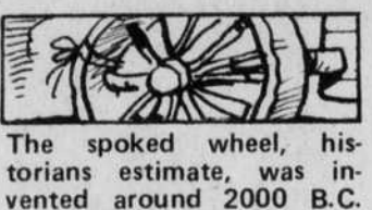
The spoked wheel, historians estimate, was invented around 2000 B.C.