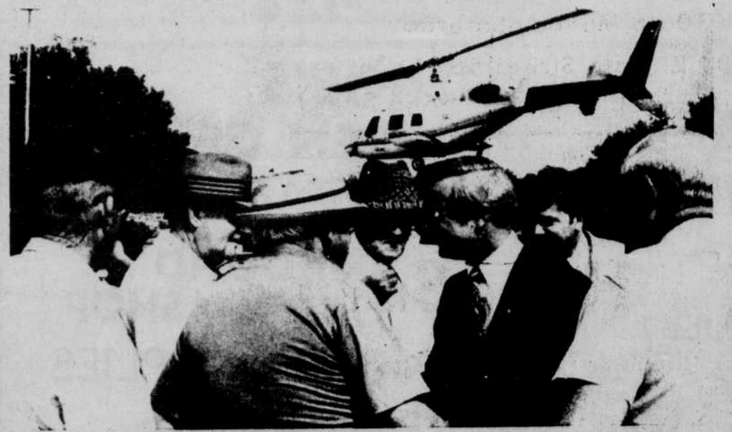
Governor Jim Hunt Greets Citizens After Arriving in Marion By Helicopter

A report to the taxpayers on how Jim Hunt uses State equipment and your tax dollars to build the Jim Hunt Political Machine