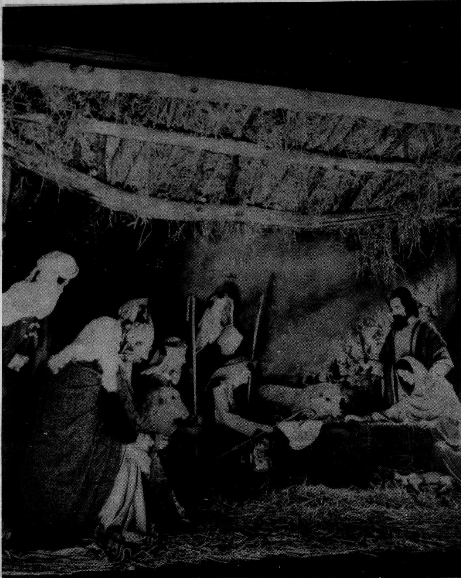
And it came to pass, as the angels were gone away from them into heaven, the shepherds said one to another, Let us now go even unto Bethlehem, and see this thing which is come to pass, which the Lord hath made known unto us. And they came with haste, and found Mary and Joseph, and the babe lying in a manger. [Luke 2:15-16. ]

Solution to the December 8 Crossword Puzzle