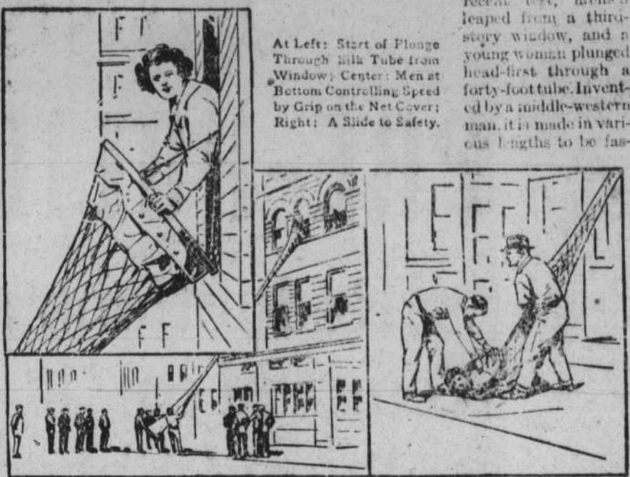
At Left: Start of Plunge Through Silk Tube from Window; Center: Men at Bottom Controlling Speed by Grip on the Net; Right: A Slide to Safety.

For saving the lives of persons trapped in the street corner speed of the falling buildings, a long, silk tube, falling body by holding out or loosening enclosed in strong netting, has been used in a recent test, firemen leaped from a third-story window, and a young woman plunged head-first through a forty-foot tube. Invented by a middle-western man, it is made in various lengths to be fast-