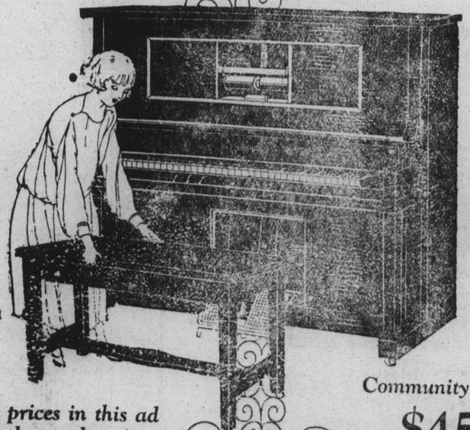
Community Model $450