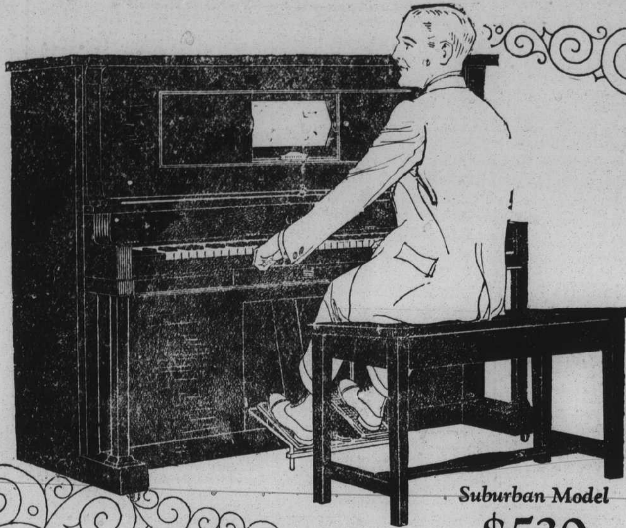
Suburban Model $530