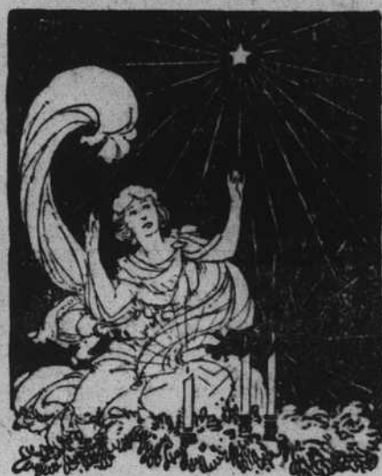
The Spirit of Christmas.

There is no geographical limitation when we are extending the hand of assistance to one who needs our help: