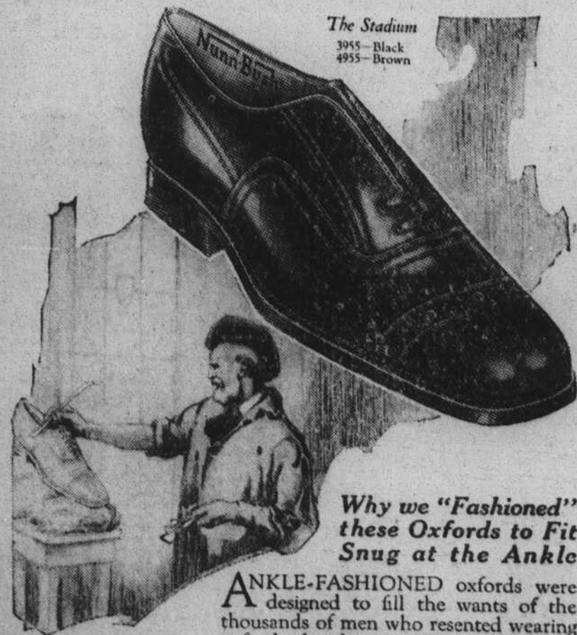
The Stadium 3945—Black 4935—Brown

LET KELLY'S STORE BE YOUR STORE. THE EXCLUSIVE MEN'S AND BOY'S STORE OF QUALITY.