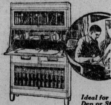
Desk and Bookcase Combined