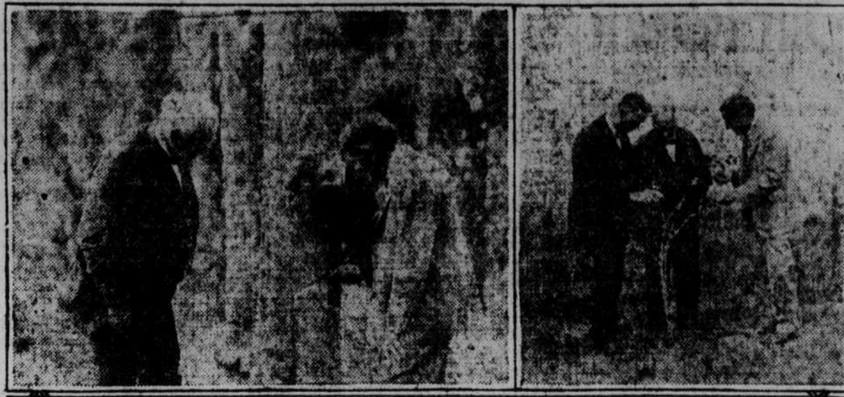
Left, Thomas A. Edison and Harvey S. Firestone watching a plantation expert tap a rubber tree on the Edison estate in Fort Myers, Fla. Right, Mr. Edison and Mr. Firestone, with a rubber plantation expert, examining a young rubber tree on the Henry Ford Farm near Labelle, Fla.

HARVEY S. FIRESTONE more than two years ago predicted a rubber shortage, and said the British crude rubber restriction act would cost the American people millions of dollars.