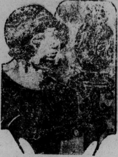
This is Constance Talmadge. She is talking over the radio at Hollywood at 3 a. m. Her voice is carried immediately to Australia. But folks over there hear the voice at 9 p. m. in an autumn month. Difference in time and seasons is the explanation.