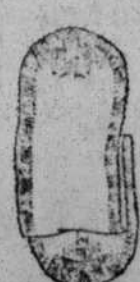
Table Scarfs Stamped

Pretty patterns to embroider! Good materials! Priced low. 49c