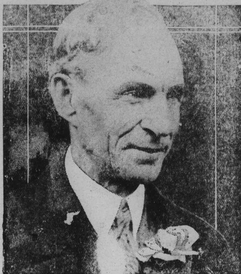
This is one of the best 1927 pictures taken of Henry Ford, the Detroit billionaire, who recently was injured when his limousine was crowded off the road by a larger car. It shows Ford as he appeared shortly before the accident.