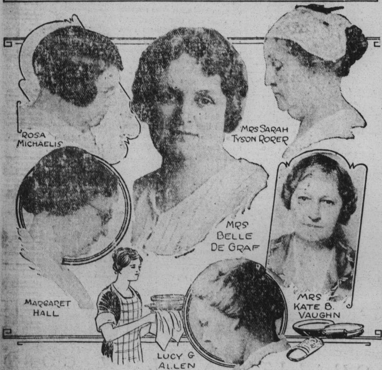
Six of the country's most famous cooks who are contributing many splendid cooking articles.

A POST-GRADUATE course in cooking! That's what we are giving our women readers, commencing today. Here's an opportunity to increase your cooking skill through the experience of experts. Six nationally famous cooking authorities have contributed to this series. Their favorite, tested recipes and many practical household suggestions make many instructive, easy reading articles. You have heard of every one of these famous cooks. But here's just