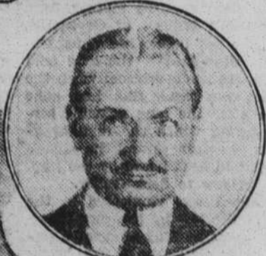
Florenz Ziegfeld, famous theatrical producer, services