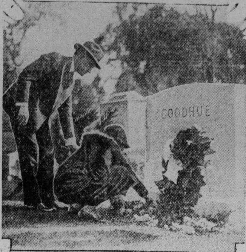
This unusual and touching picture shows President and Mrs. Coolidge at grave of first lady's father in Green Mount cemetery, Burlington, Vt., where they stopped en route to Plymouth Notch, where chief executive was born and where he took oath of office.