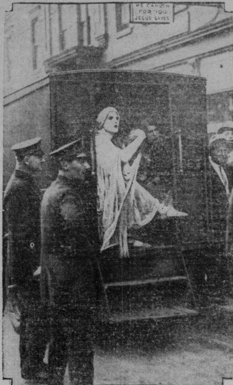
This gentleman—it's a "he" despite the clothes—is one of many female impersonators who were in cast of "Pleasure Man," the Mae West show which was twice raided by New York's Finest. The players were put under $500 bond each pending arraignment in West Side court.