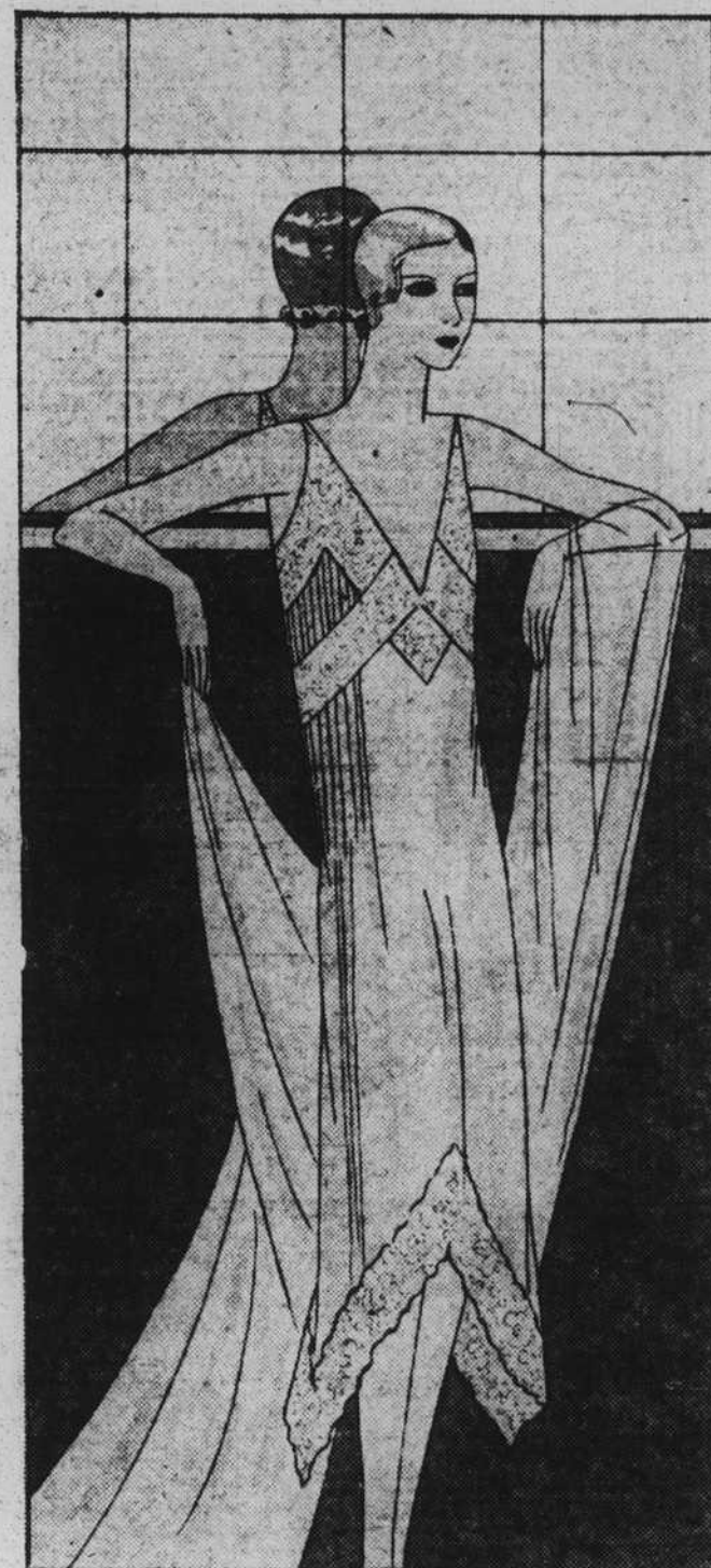
A Smart Nightrobe of Flesh Colored Crepe de Chine. Note the Unusual Manner in Which Bandings of Alencon Lace Are Applied.

The Fashion Editor of Panorama Magazine Discusses Lingerie