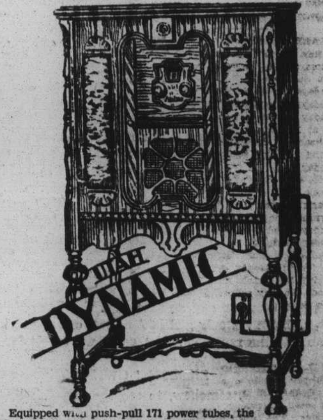
Equipped with push-pull 171 power tubes, the latest means of improved amplification to clarify the quality of reproduction and avoid overloading of tubes.