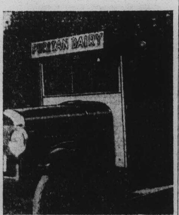
Truck operated by Lee McGuire in which the test was made

Drained, flushed and refilled with "Standard" Motor Oil and "Standard" Gasoline, the truck started on its rounds again. The same route was followed. Another eight days passed. Somehow 680 miles were clocked on the speedometer this time. But only 67 gallons of "Standard" Gasoline had been used as against 80 gallons in the previous period.