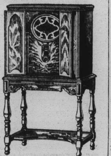
Model 92 $167.50 (less tubes)

plus the exclusive Majestic Automatic Sensitivity Control gives you QUIET, Smooth Reception, with no oscillation on the low wave lengths as well as the high ones FOUR TUNED STAGES RADIO FREQUENCY No A-C Hum