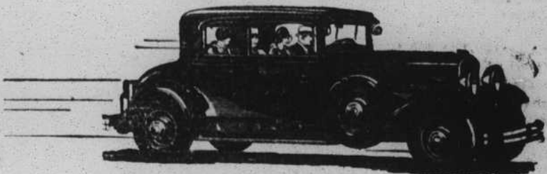
CHRYSLER "77" CROWN COUPE, $1775 (Special Equipment Extra) 4.4.9