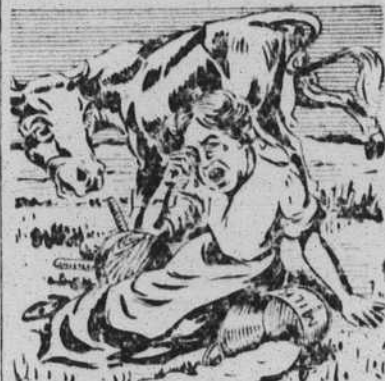
CRYING OVER SPILLED MILK