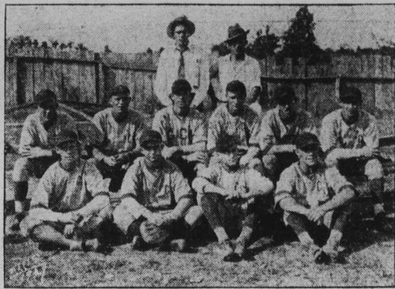
Above is the baseball outfit which won the Cleveland county league baseball pennant. The victorious club, the Cleveland cloth mill outfit, did not lose a game during the league schedule, although dropping the city title here last week to Eastside, the runner-up club in the county loop.