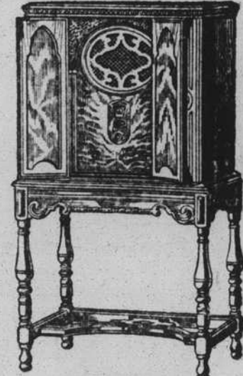
Model 92 $167.50 (less tubes)

FOUR TUNED STAGES RADIO FREQUENCY No A-C Hum