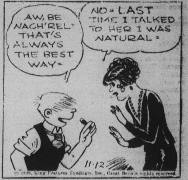
Saving Her Situation.