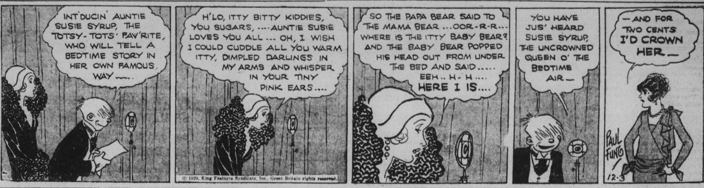
"Music" To His Ears