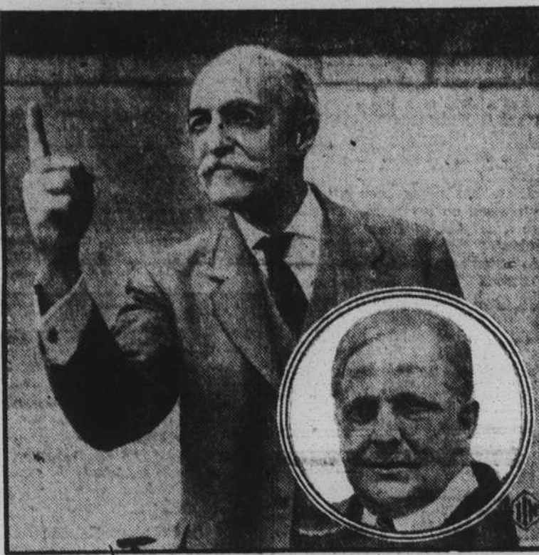
Pennsylvania's super-hectic primaries showed Secretary of Labor James J. Davis defeated Senator Joseph R. Grundy for the Republican Senatorial nomination. Gifford Pinchot, the veteran Progressive on a "bone-dry" platform, won the Republican gubernatorial nomination.