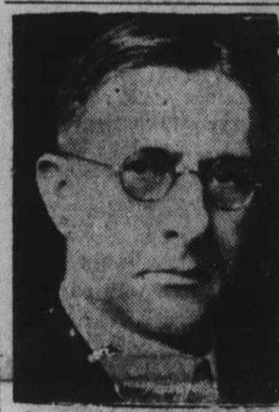
JOSIAH W. BAILEY

Charlotte, June 9.—Josiah William Bailey, Raleigh attorney, defeated United States senator Furnifold M. Simmons, of New Bern for the Democratic nomination for senator on the basis of incomplete returns from Saturday's Democratic primary election.