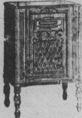
NEW VICTOR RADIO RE-57 The first micro-synchronous, screen-grid, 5-circuit radio.

NEW VICTOR RADIO Home Recording Electrola RE-57 Completely NEW, 3 Supreme Instruments in one. Matchless Performance—Superb Beauty.