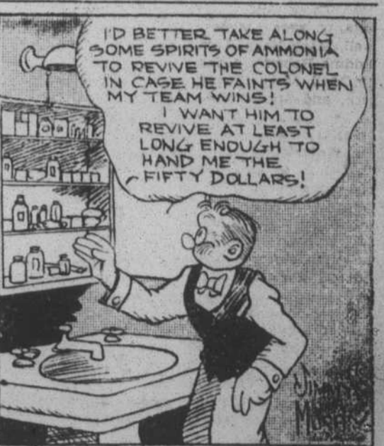
The Game Is On!