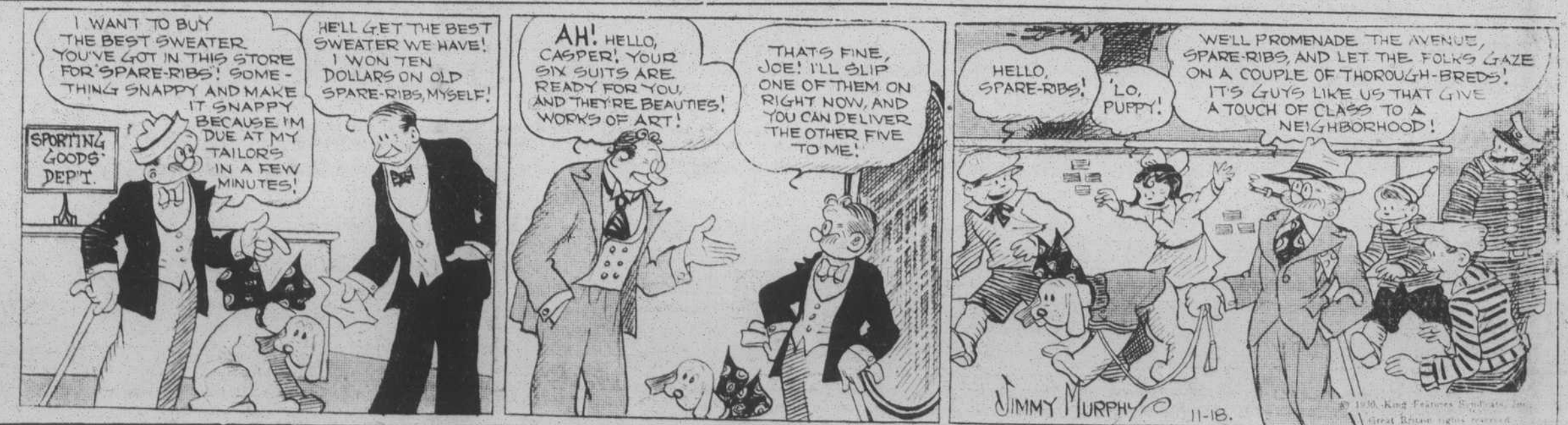
A Keen Sense Of Hearing.