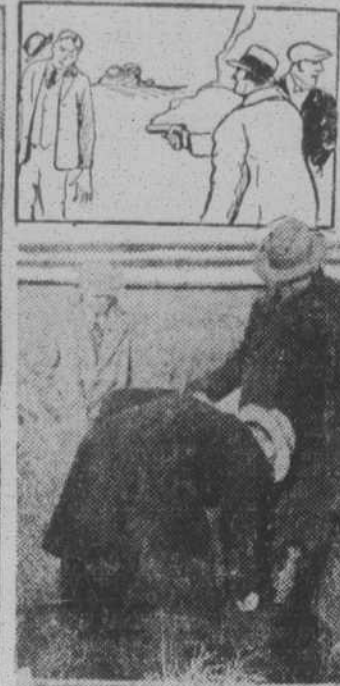
EXAMINING BODY OF SWEENEY.