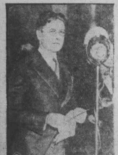
Philip La Follette, son of "Fighting Bob," pictured making a speech after taking oath of office as Governor of Wisconsin. The inauguration ceremonies were attended by notables from every part of the State.