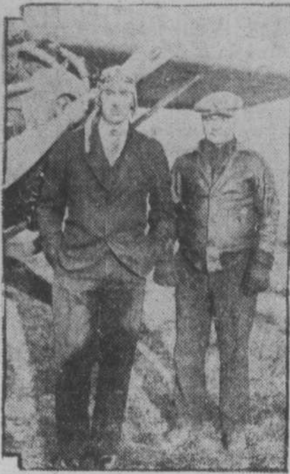
AVIATORS WHO DISCOVERED GANGSTER'S BODY.