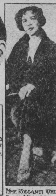
TOWN OF OSLO, SWEDEN. MME. MICHAELOVNA KOLLONTAI.