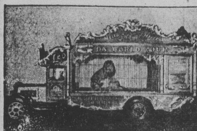
LEO. METRO-GOLDWYN-MAYER LION IN HIS PALATIAL TRAVELING CAGE IN WHICH HE IS NOW TOURING THE WORLD