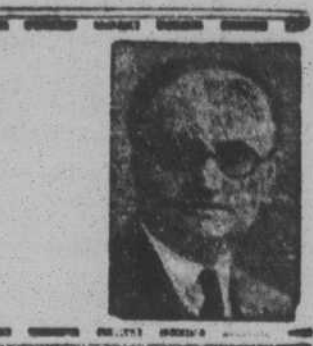
Portrait of a man, likely related to the 'Nobody's Business' article.