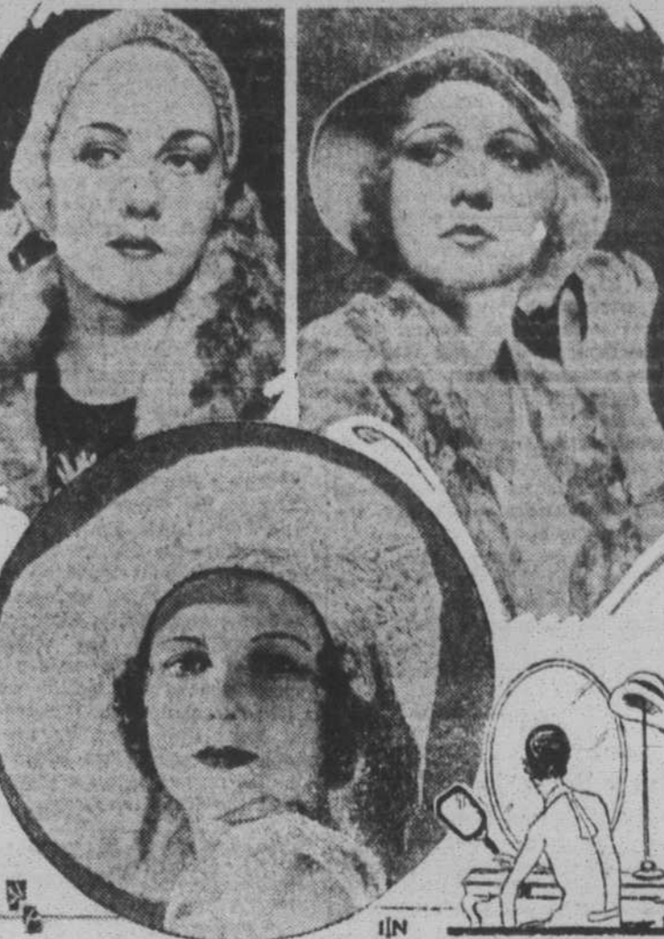
Although young men may think of love in the Spring, this trio of lovely maidens would seem to prove that their own sex think rather of the new Spring styles, and display the latest models in head dress. At the left we have the popular off-the-face hat, ideal for street wear. (Right) The light panamalac hat, which properly sets off the all-white Summer dress. (Below) The wide-brimmed lacy straw hat, with braided design, which matches with the new modes of frilly gowns.

Straws, New and Exotic and Important. Play a Leading Part in Creations Offered by Moguls of Millinery World.