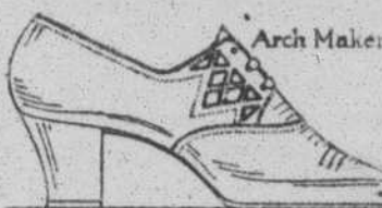
Arch Maker. Ladies Sea Sand with Beige Reptile Calf Trim. Cuban heel, Spanish Arch, also same in Black Kid with Black Reptile Calf Trim.