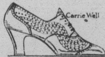
Ladies Sea Sand Kid with Suntan Kid Trim, Welt, Arch Rest Combination Last. Same in black Mat Calf with black and grey Lizzard Calf Trim.