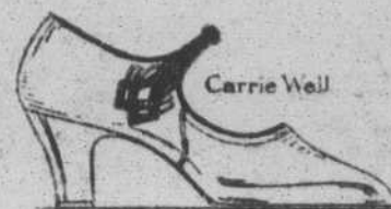
Ladies Beige Kid with Suntan Trim, Louis covered Heel Arch Rest Combination, also same in black Kid with black Reptile Calf Trim.