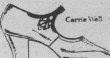
Ladies Beige Kid with Suntan Inlay Strap, Welt, 15-8 Covered Cuban Heel, Arch Rest Combination Last. Same in black Kid, Grey Lizzard Inlay.