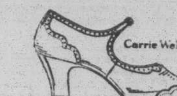
Ladies' Beige Kid Vamp and Quarter with Suntan Kid Tip, covered Louis Heel also in black Mat Calf Vamp and Quarter with black Lizzard Trim Strap, Arch Construction.