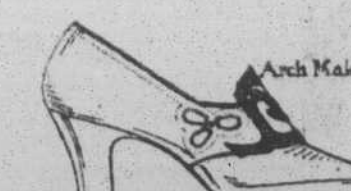
Vanity Arch, Ladies Beige Kid with Suntan Kid Trim, 16-8 Louis Heel.