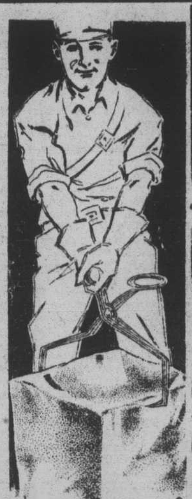
A Sign Of Refrigeration Certainty

When you place your refrigeration reliance upon the regularity of our Ice Delivery you know that not only is your Ice Chest to be properly efficient throughout the day and night but you also know that you are getting pure, firm, "wet-cold" Ice as Nature made it ... free from mechanical breakdowns, defrosting interruptions and chemical action upon your food.