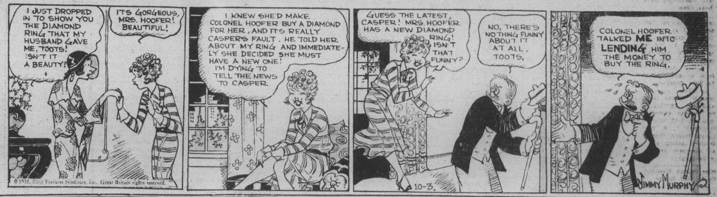
A Surprise For Toots.