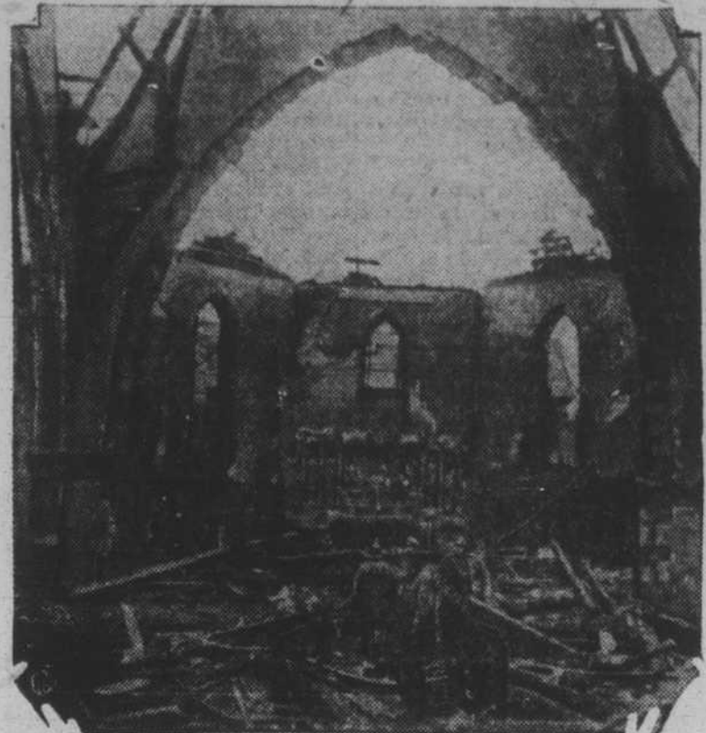
Photo shows the pathetic ruins of the Episcopal Church of All Saints at Worcester, Mass., after it had been gutted by fire. The loss is estimated as $225,000 and is partly covered by insurance. This was the eighth fire in the city in one week and police believe it to have been of incendiary origin. Police reserves have been called out to guard against a band of firebugs believed to be operating in Worcester and have orders to "shoot to kill" if their suspicions warrant it.