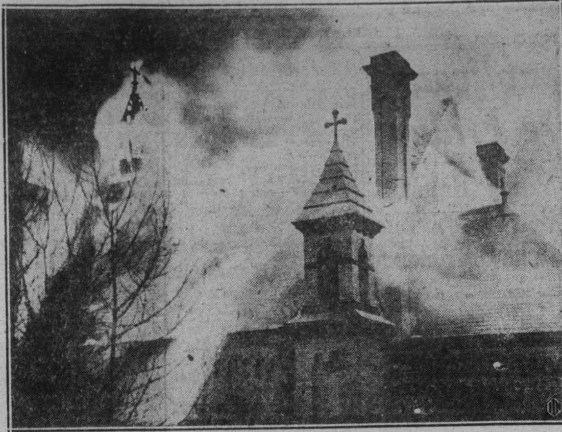
Proving that the fire demon is no respecter of sentiment, religious or otherwise, this spectacular blaze razed the beautiful church of St. Mary Magdalene, of Pittsburgh, Pa. Six firemen were overcome by smoke and five others were hurt by falling debris in their attempts to subdue the flames. The blaze toppled the huge 175-foot twin steeples—one of which is shown flaming at left—throwing thousands of spectators into a near panic. Damage is estimated at $500,000.