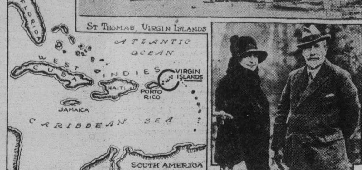
MAP SHOWING LOCATION OF ISLANDS