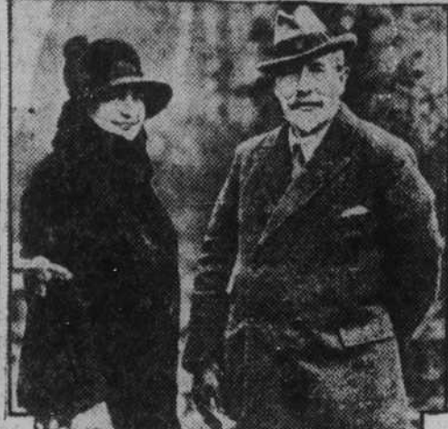
EX-KAISER WILHELM and WIFE.

Following press dispatches revealing that physicians attending former Kaiser Wilhelm, of Germany, in Doorn, Holland, suggest that an indeterminate stay in the West Indies would be extremely advisable, two civic organizations of St. Thomas, capital of the islands, have forwarded invitations to the exiled monarch to accept hospitality at that department. However, it is unlikely that the ex-Kaiser would consent to putting so much distance between himself and the country that was once the theatre of his glories. He is fairly well content at Doorn, where he leads the simple life of a country gentleman, keeping fit by working around his estate, chopping wood and engaging in other manual chores. Though it is still a firmly entrenched belief in Germany that Wilhelm would welcome a chance to return to the helm of state, the ex-Kaiser's attitude in the recent elections does much to brand the belief a fallacy. It is reported that had not Wilhelm vetoed the idea, both Adolf Hitler and President Paul von Hindenburg would have withdrawn from the presidential race and left a clear field for the former Crown Prince as the first step toward restoring the Hohenzollern dynasty. Though it is still a matter of conjecture as to the royal exile's reaction to the Virgin Islanders' invitation, it would be strange if he were to take refuge in a territory controlled by the United States, which more than any other allied nation is responsible for his being an "ex."