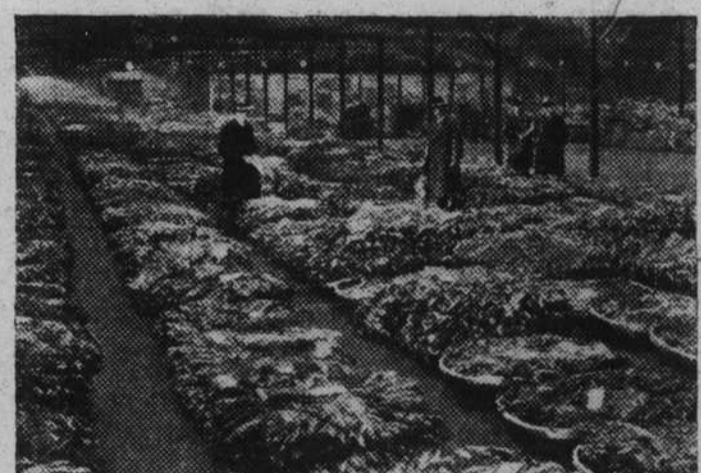
Auction today! Chesterfield buys the best