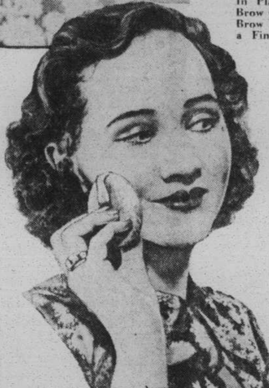
Then Pat on as Much Powder Over the Cream as Will Adhere to the Skin and After a Few Minutes Dust Off the Surplus and Blend With a Soft Camel's Hair Brush.

After removing your cleansing agent and sponging this tonic over the skin, let it dry. While the boric acid and witch hazel tonic is drying you can be twisting a bit of cotton around the