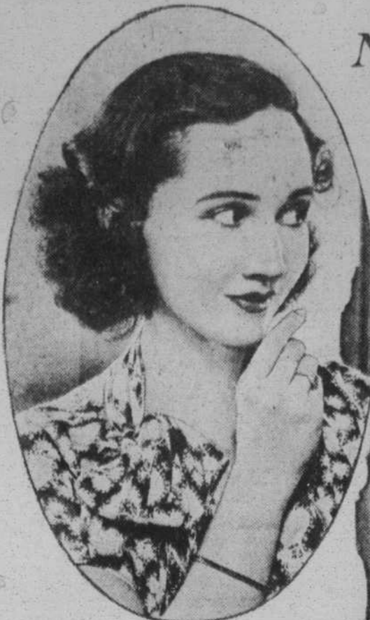
After First Thoroughly Cleansing the Skin and Then Freeing It of All the Cleansing Lotion, Apply a Faint Touch of the Liquid Rouge Using a Small Pad of Cotton for This Purpose, as Shown Here.