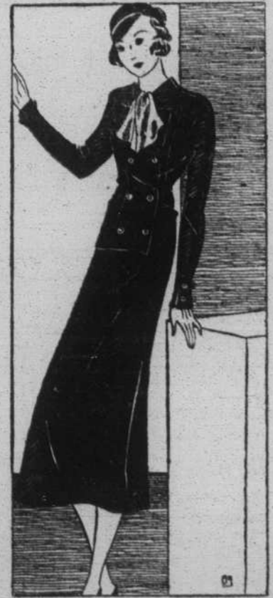
A Very Youthful Tailored Suit of Diagonal Weave Wool in Navy Blue Features a Tie Scarf in One Piece with the Sleeves. The Jacket is Double-Breasted and Fastens with Gleaming Silver Buttons.

Of diagonal weave in navy wool, its lines are typical of the new silhouette. The double-breasted jacket gleams with silver buttons and the clever scarf collar is cut in one with the sleeves and lined with white crepe. A straight skirt falls well below the knees and the long tight sleeves