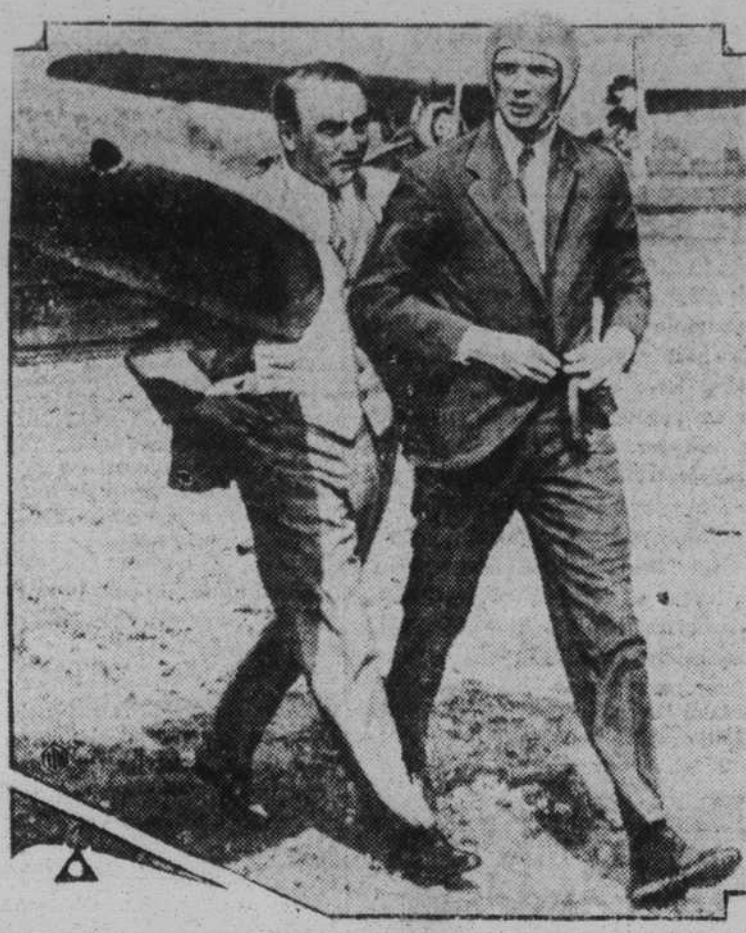
Showing unmistakable signs of the tragedy that shadowed his life, Colonel Charles A. Lindbergh is shown with a reporter as he made his first appearance at Newark, N. J., Airport since his baby son was found murdered several months ago.