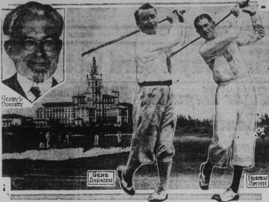
Winter, Florida and golf, a natural combination and the Sunshine State sets the pace with the Miami-Biltmore $10,000 open tournament at Coral Gables next week.