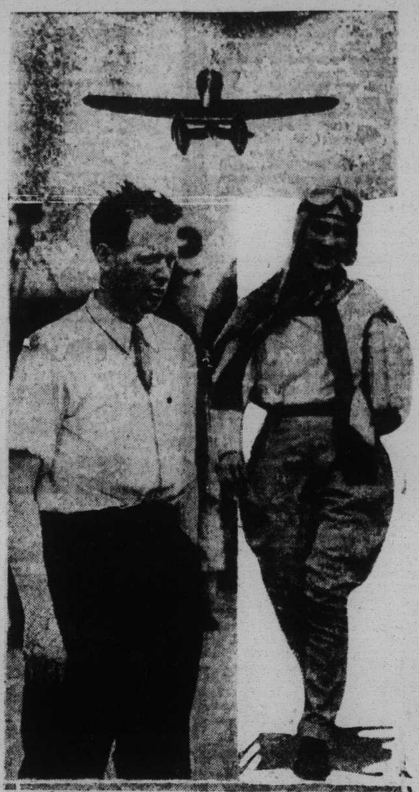
Another photo of the takeoff of the Lindberghs for Europe from North Beach Airport, Long Island, N. Y., and closeups of the famous flying pair just before they mounted their plane.