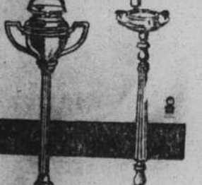
SMOKING STAND $1.94

Just the thing to make the room look complete. An inexpensive gift, too!