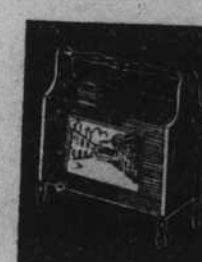
MAGAZINE RACK $1.94