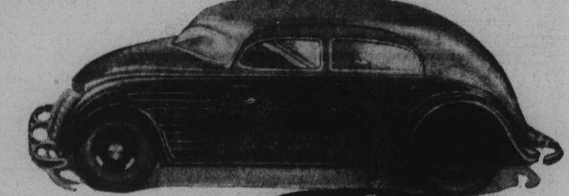
AMERICAN STREAM-LINING (Above): with rounded nose as well as streamlined rear, this model shows a 35% reduction in air-drag over familiar cars, and represents a complete redesigning of the old auto chassis, with all steel functional construction and interior so designed that no passengers sit over the wheels.