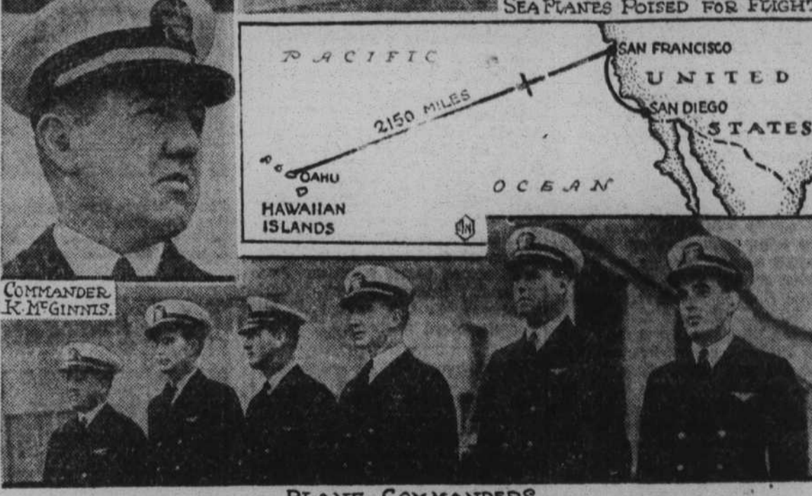
PLANE COMMANDERS With the Naval Base at Pearl Harbor, Hawaii, as its goal, VP Squadron Ten, of the U. S. Naval Air Force, will leave San Diego, Calif., on January 12, and after a brief halt at San Francisco, will head over the Pacific on the longest non-stop flight ever attempted in mass formation.