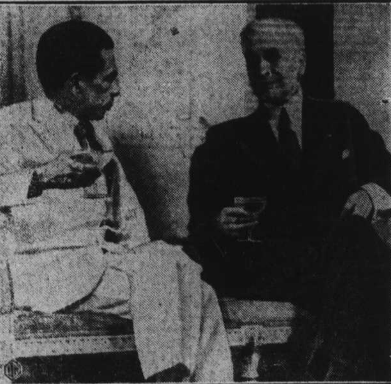
Now that the law has okayed it, a wandering United States statesman can bend the elbow in good-fellowship without shocking the folks back home. Here's Secretary of State Cordell Hull (right) and President Hiram Bingham of Panama, discussing international relations and peace in goblets of sparkling champagne at Panama City. Secretary Hull recently returned to Washington after South American tour.