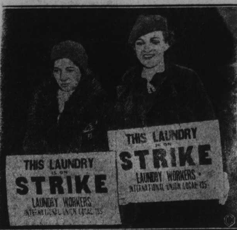
The Governor's Lady and a humble laundry worker are linked in the great sisterhood of woman as Mrs. Gifford Pinchot (right), wife of Pennsylvania's chief executive, dons a sandwich board and becomes a strike picket to aid laundry workers in New York. Mrs. Pinchot played a similar role during strike of shirt makers in Philadelphia last year.