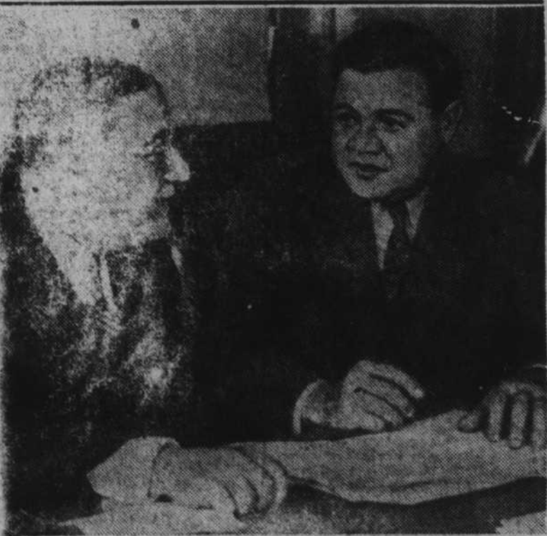
Eight times these two men, Colonel Jake Ruppert (left), owner of the New York Yankees, and Babe Ruth, star slugger of the team, have been photographed in a setting such as this. But on this occasion there was a slight shadow over the proceedings, for Babe signed a contract for 1934 at a figure $17,000 lower than last year's. However, $35,000 is a pretty nice salary at that.