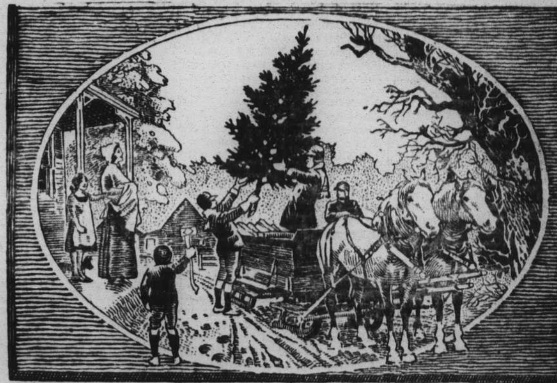
Christmas in the Eighties

For Greater Results In Selling—Try Star Adv.