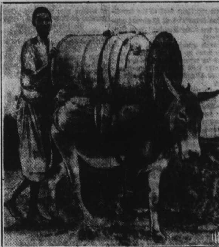
Water holes in Abyssinia are few and far between and the Ethiopian version of Kipling's immortal Gunga Din is a handy man to have around. Here is one, with his donkey laden to capacity, following troops on march.